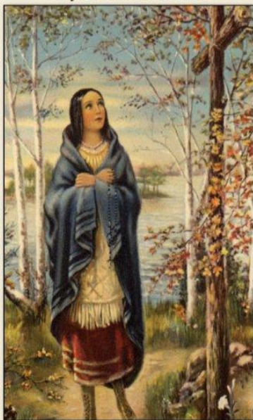
1656-1680 Memorial - 14 July

Blessed Kateri Tekakwitha Lily of the Mohawks