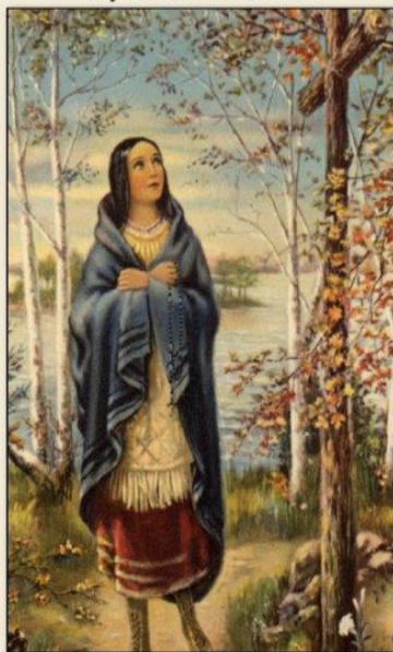
1656-1680 Memorial - 14 July

Blessed Kateri Tekakwitha Lily of the Mohawks