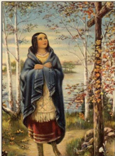
1656-1680 Memorial - 14 July