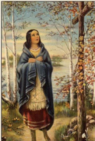
1656-1680 Memorial - 14 July