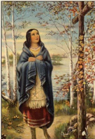
1656-1680 Memorial - 14 July

Blessed Kateri Tekakwitha Lily of the Mohawks