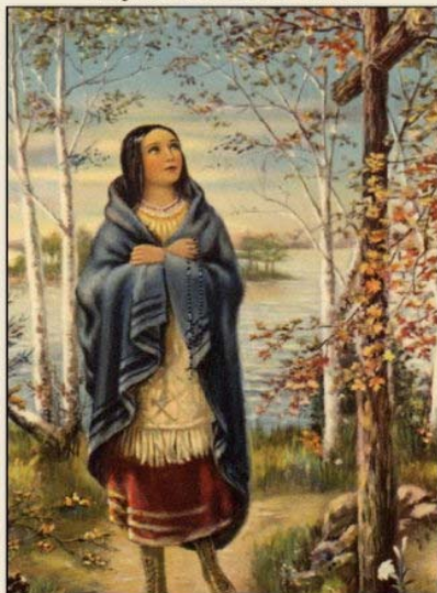
1656-1680 Memorial - 14 July