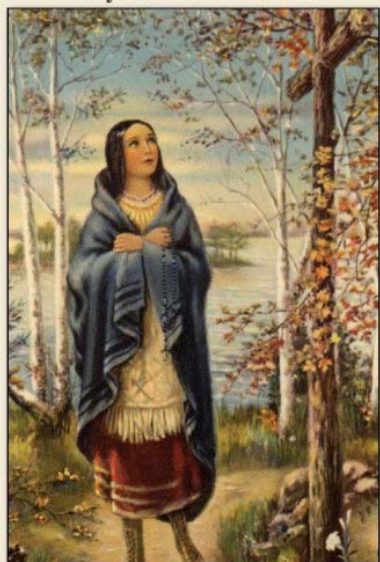
1656-1680 Memorial - 14 July

Blessed Kateri Tekakwitha Lily of the Mohawks