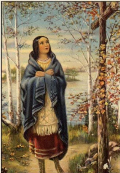
1656-1680 Memorial - 14 July