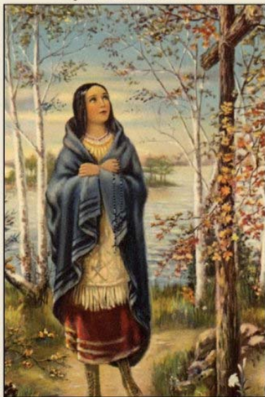
1656-1680 Memorial - 14 July