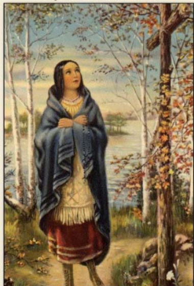
1656-1680 Memorial - 14 July