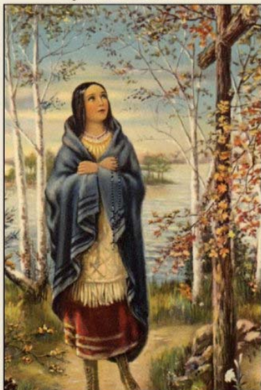
1656-1680 Memorial - 14 July